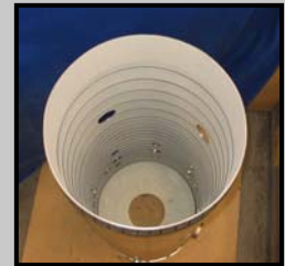
MS7001EA Combustion Liner

New repair technologies enable ICPN SERVICE to service components previously considered irreparable. With twenty-four-hour service and rapid response time, the division has earned an excellent reputation around the world as a customer-oriented high quality service provider.