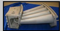
MS6001B Nozzle segment st. 3

ICPN HOLDING BV Klaroenring 54 4876XZ Etten Leur The Netherlands e-mail: info@icpn.nl website: www.icpn.nl